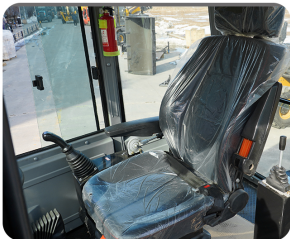
Comfortable safety seat equipped with shock absorption function to provide a more comfortable use