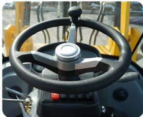
The instrument panel is simple and clear, making it easier to observe the machine status and drive experience.