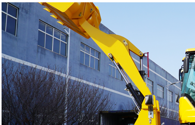
A sturdy large arm