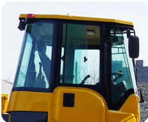
The spacious and bright cab maintains a comfortable driving