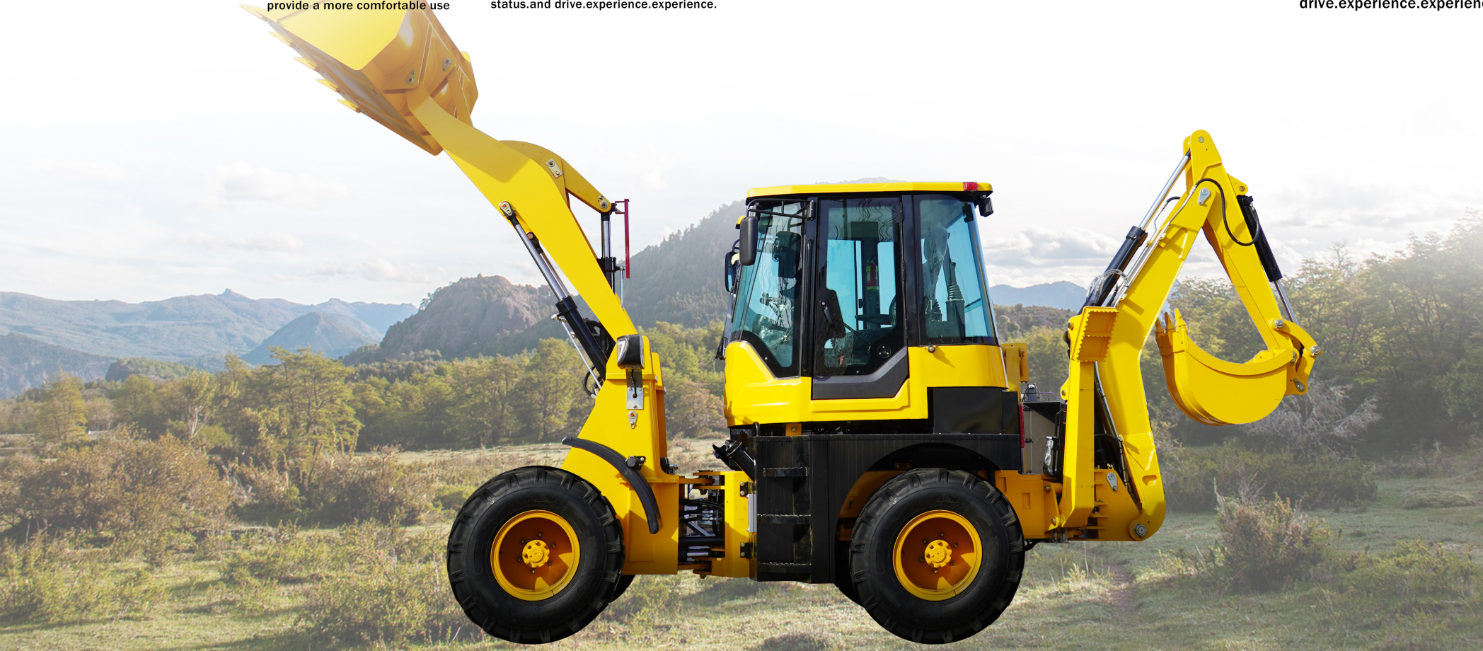
Equipped with strong arms at the front and rear and drive experience.