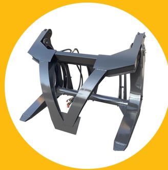
Grab a wooden fork